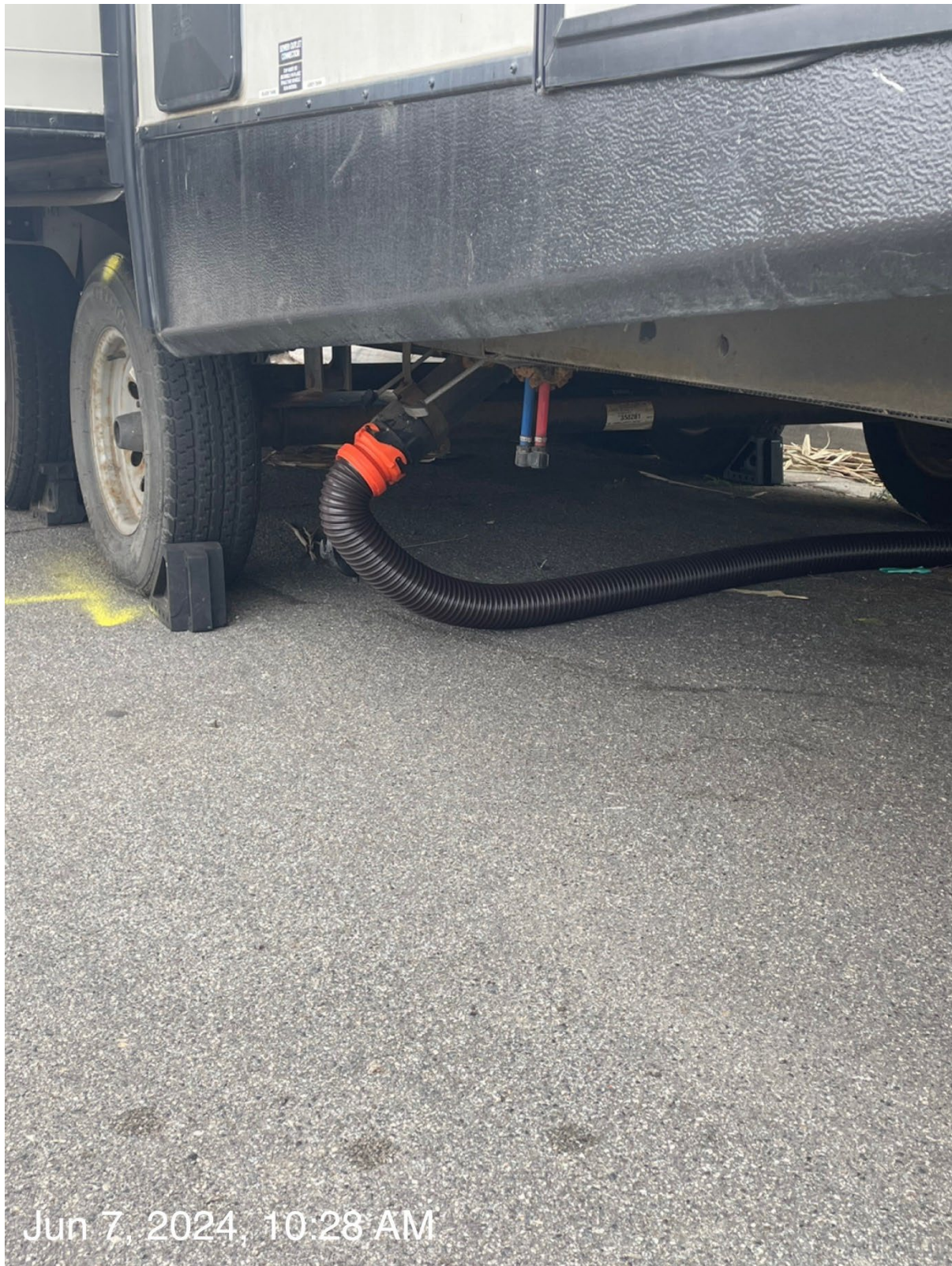
RV Parked on S. Pacific St. Discharging onto Street